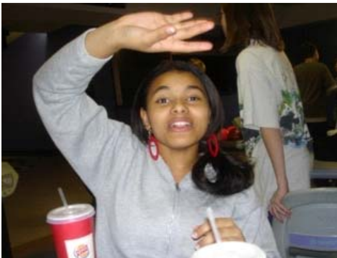
Reward day student celebrates