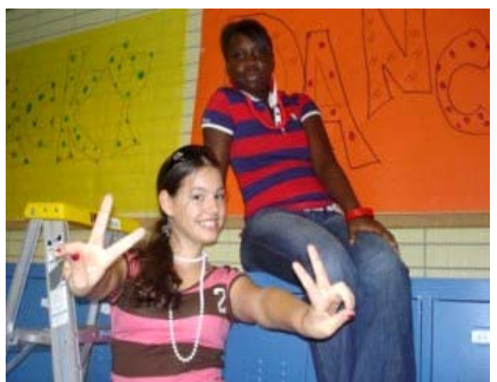
Student Council prepares for a school dance