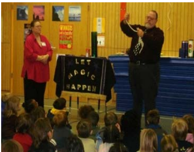
What is a magician without the old standard rope tricks?