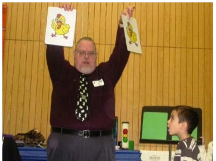
"Unbelievable! How did he do that?", thinks this student.