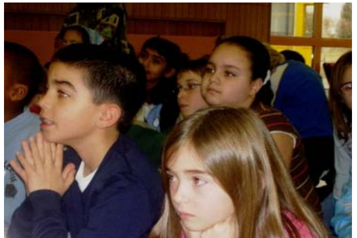
Some students can't believe their eyes