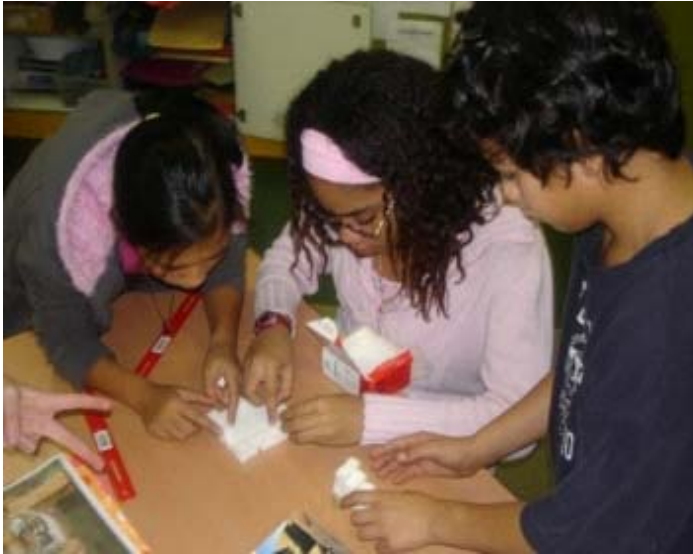
Students engaged in an ancient building reconstruction