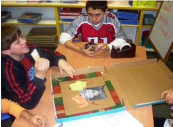
The game project is being field tested