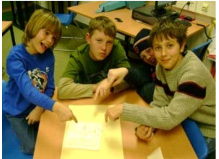
Another sugar cube structure