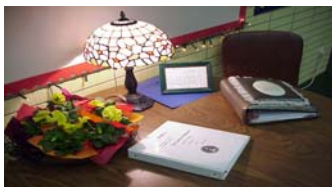
Darmstadt Honors Forum