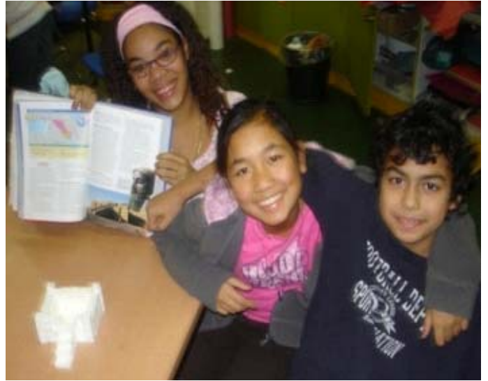
And their creation looks just like the original