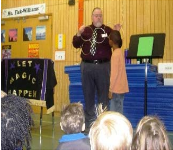
The magician and his magic rings thrill the audience