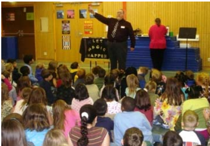
The crowd is totally engaged