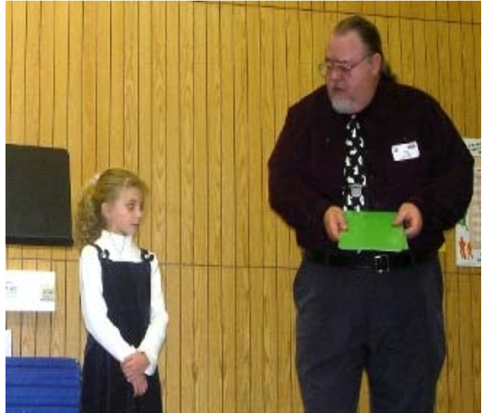
Card tricks anyone?